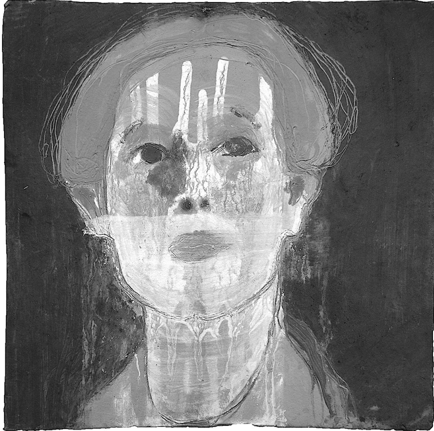
Maarit Mäkelä Portrait of a Woman 2015 (detail). Painting with Te Henga black sand, Tasman red stone, Long Bay white and yellow clay, Te Matuku clay and Cory Road clay on Matakana clay

ST PAUL St Gallery Two 27 November – 11 December